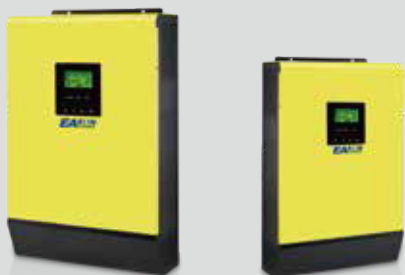
IGrid SV 1.5KW II IGrid SV 2KW/3KW/5KW II